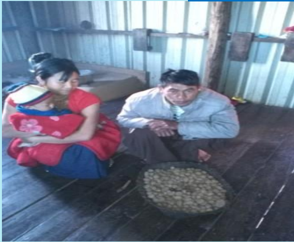
Potato seeds distribution, Daw NiTum, Nipi village, Hakha Tsp