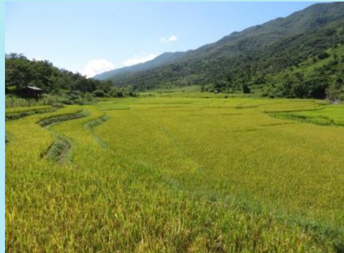
Zipi village Paddy field after Irrigation support in 1 st week of Nov' 15