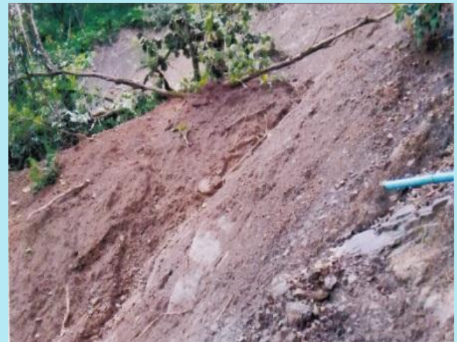
Land slide in Lente village, Falam