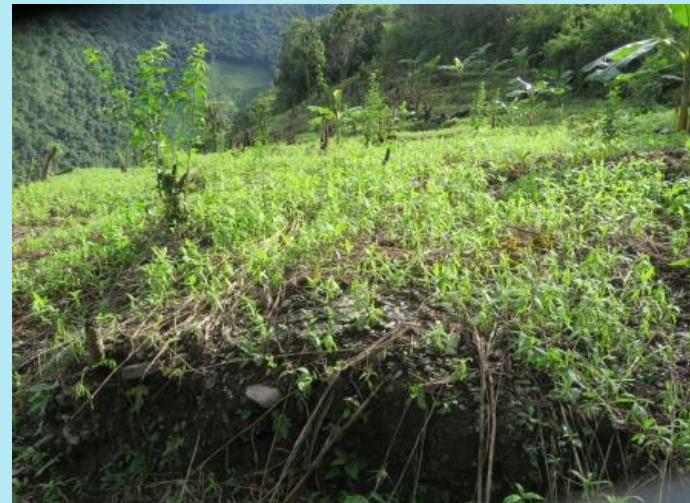
Nigger cultivation, Lente village, Falam Tsp