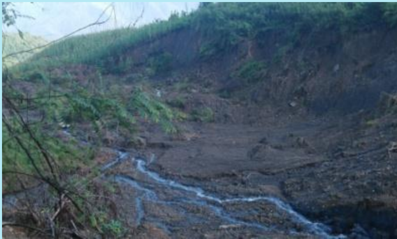
Land slide in Tiphul village, Hakha