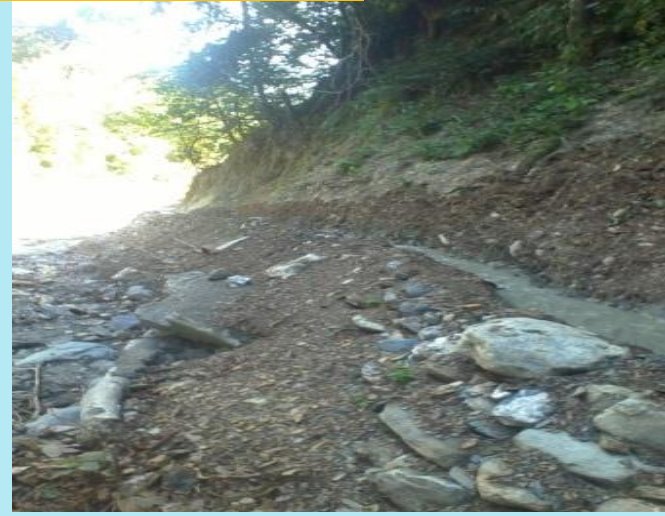
Canal line (CFW) through recovery, Tualzeh village, Falam Tsp