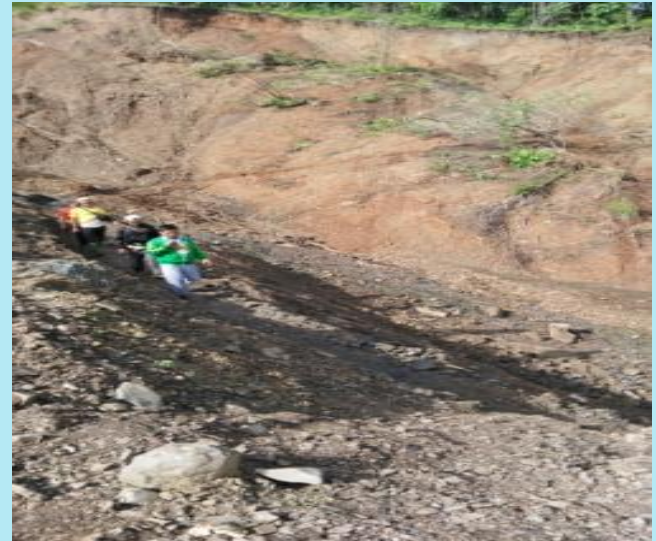
Landslide in Zokhua village, Hakha