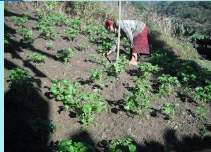
Potato cultivation plot through seeds distribution, Thanhniar village, Falam Tsp