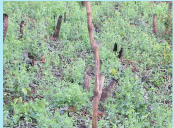
True pea Cultivation, Thlanrawn village, Falam Tsp