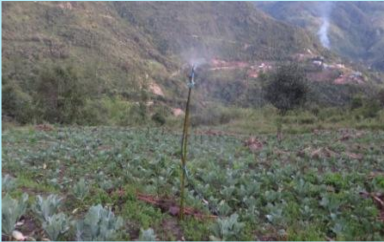
Cauliflower through seeds distribution, Thangnuai village, Tidim Tsp