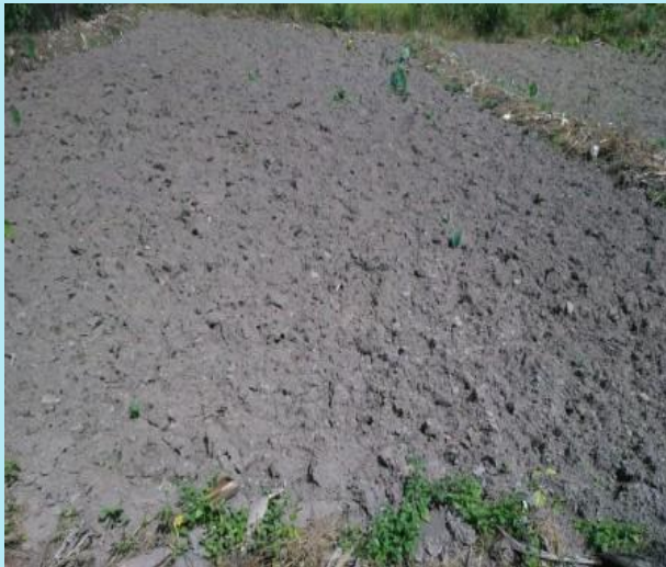
Potato cultivation plot, Nipi village, Hakha Tsp