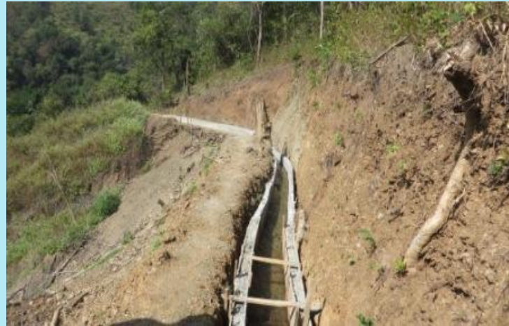
Concrete canal line through recovery support, Suangzang village, Tedim Tsp