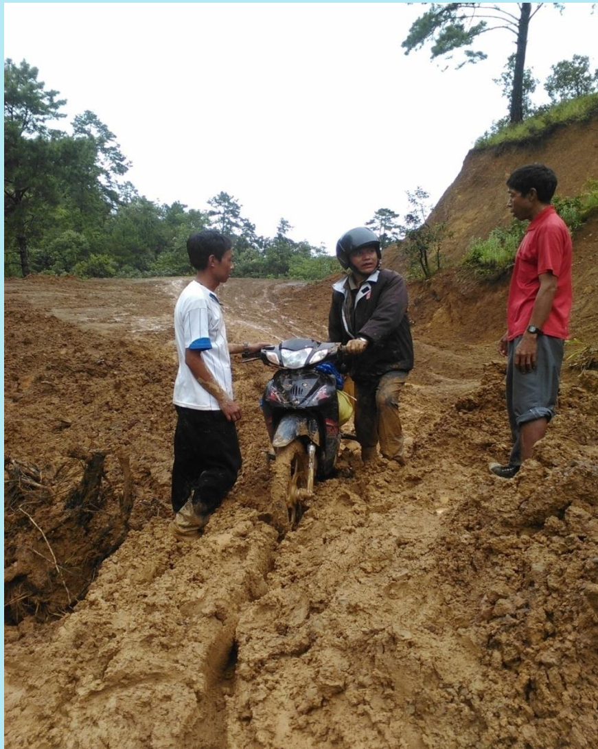
One of CORAD staff is going to take the assessment .