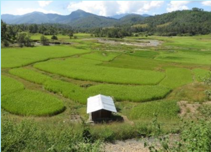
Hmawngtlang village Paddy field after Irrigation support in 4 th week of Oct' 15