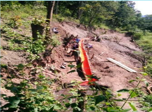
Plastic + earth Canal line for Irrigation in Suangzang village, Tedim Tsp