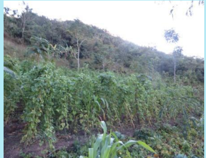
Bean cultivation in Lumte village, Falam Tsp