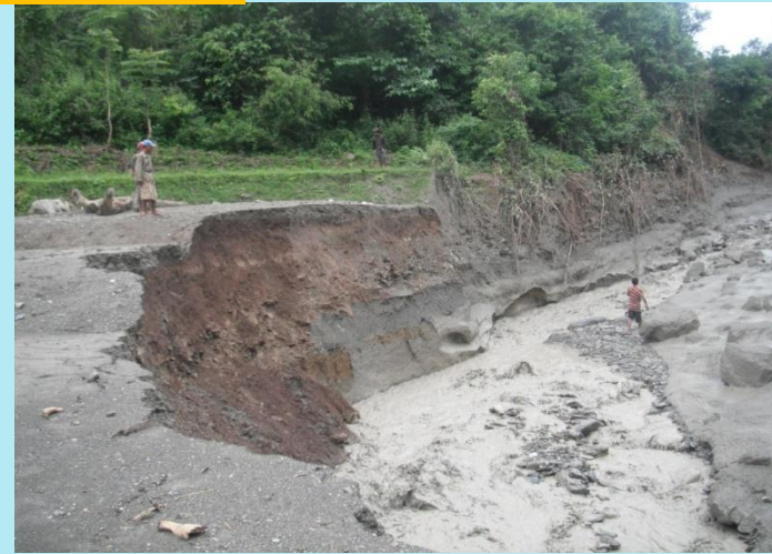
Canal line damaged, Tualzeh vlg, Falam