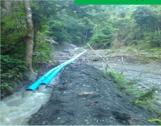
Pipe support for irrigation in Tualzeh village, Falam Tsp