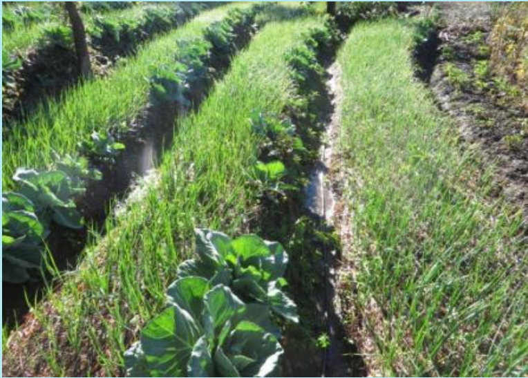
Garlic cultivation in Congkua village, Falam Tsp