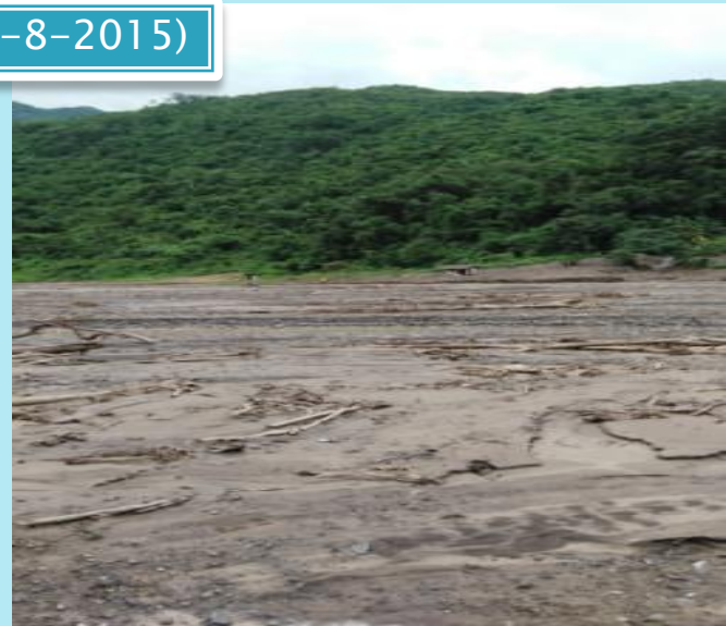
Paddy field flooded, Tiphul village