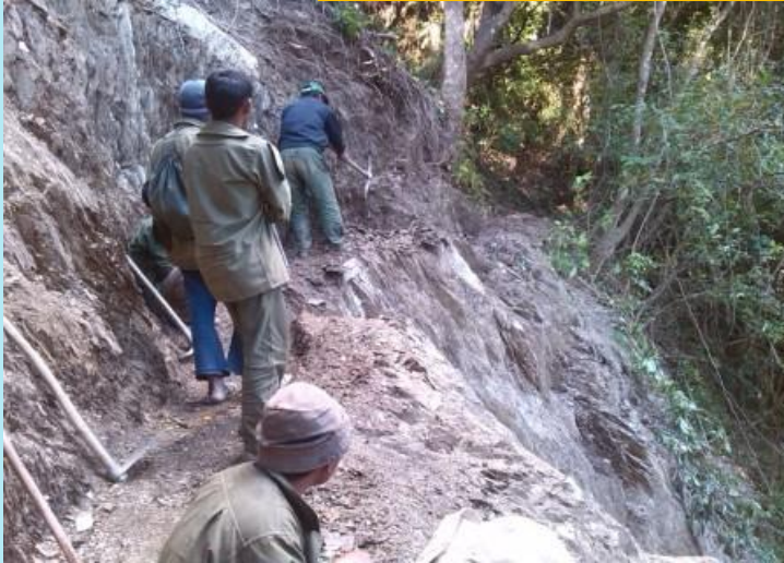
Canal line digging (CFW) in Suangpi village, Tedim Tsp