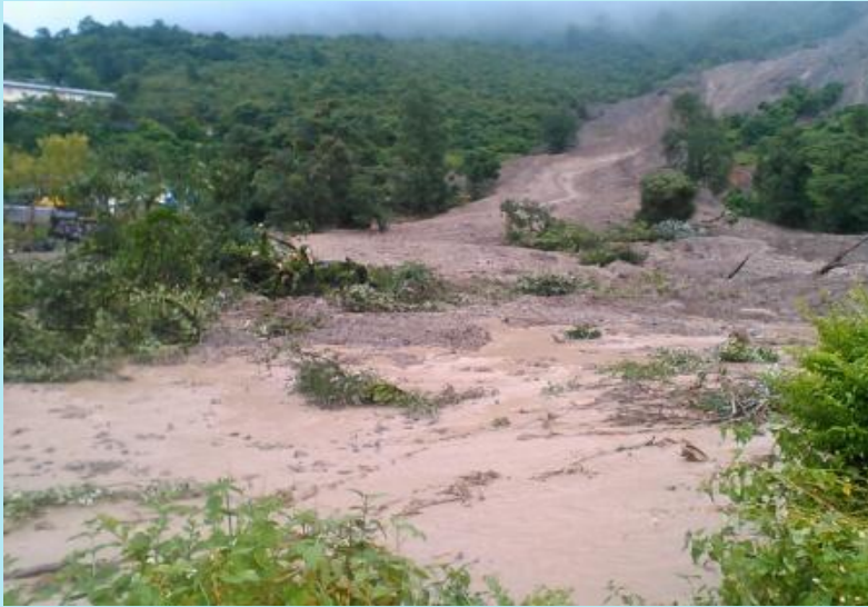
Landslide in Rungtlang, Hakha