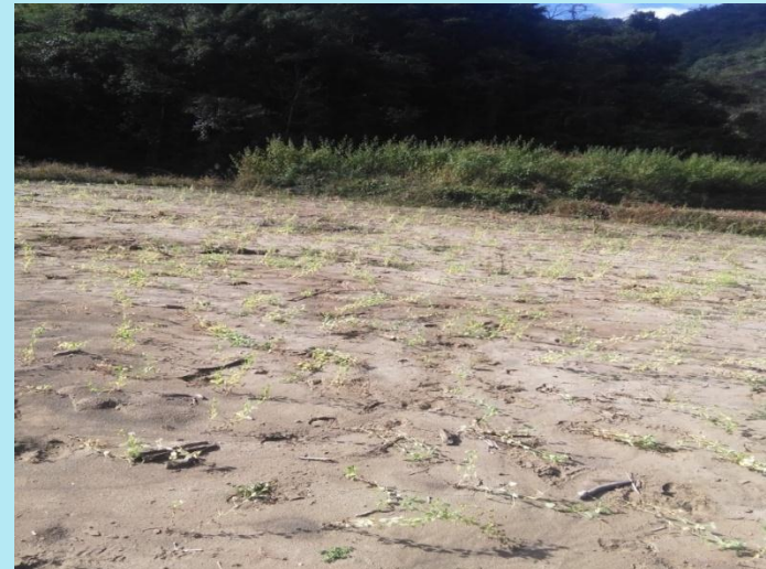
Paddy field damaged, Cinkhua vlg, Hakha