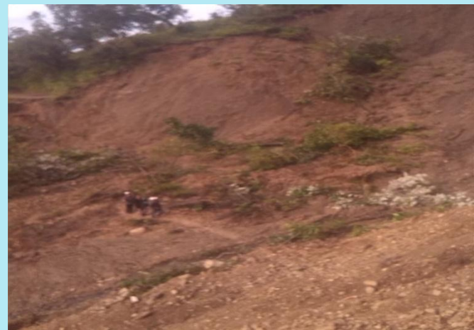
Landslide in Tili village, Falam Tsp