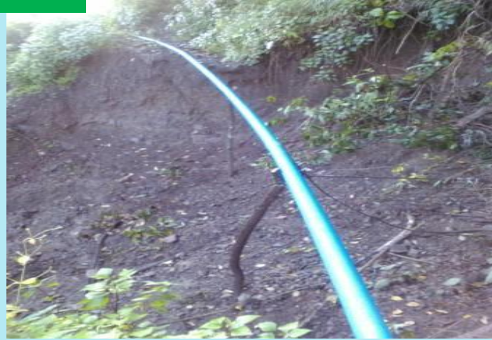
Pipe support for Irrigation in Hranhring village, Hakha Tsp