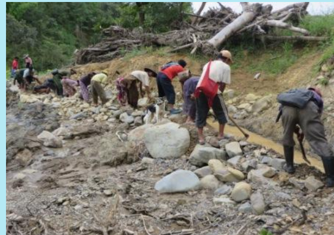
Canal line digging, Phaikhua village, Thantlang Tsp