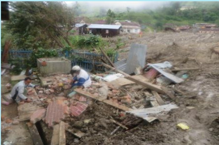
Land slide in Tuikhingzang, Kalay