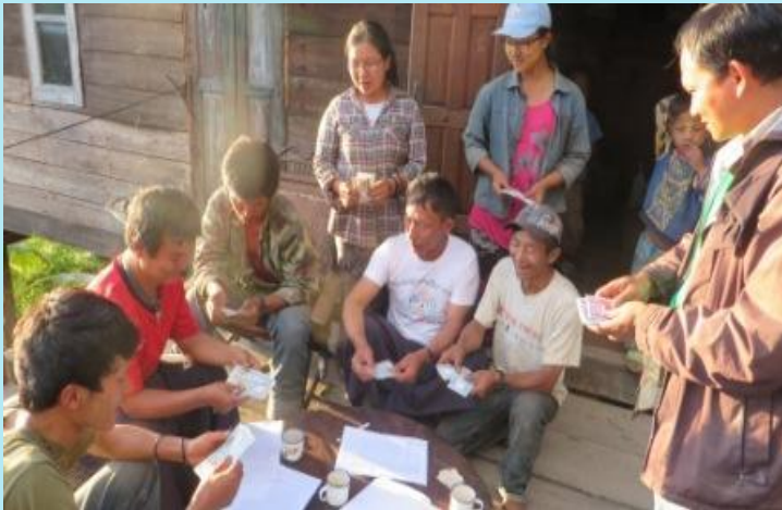
Cash distribution for CFW (Canal) in Thangnuai village, Tedim Tsp