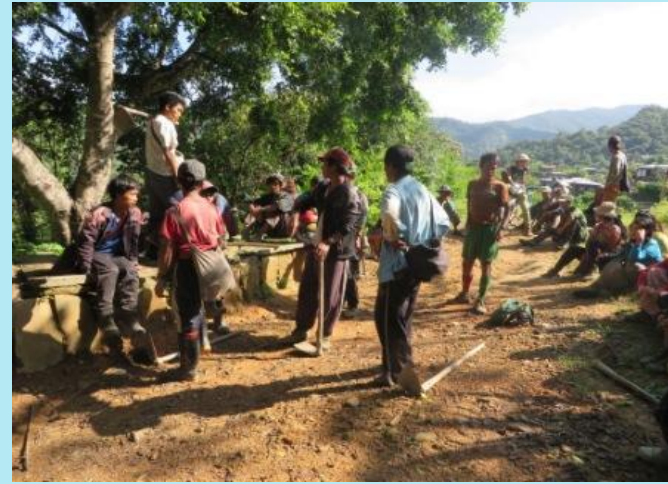
Work organization for Canal line rehabilitation in Zipi village, ThantlangTsp