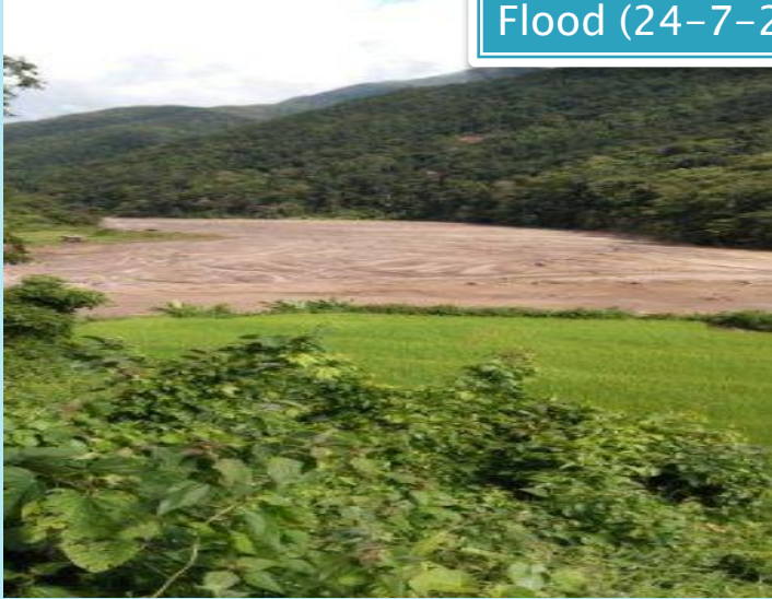
Paddy field flooded, Tiphul village