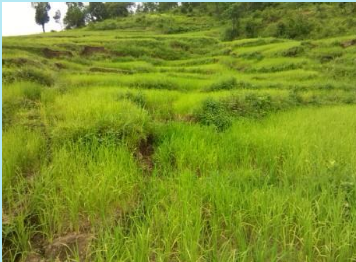
Paddy field damage, Chuncung vlg, Hakha