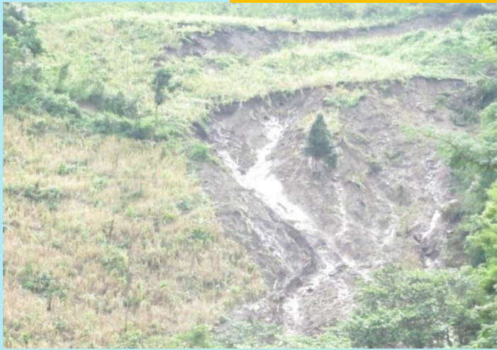
Sumhrang village, Falam Township