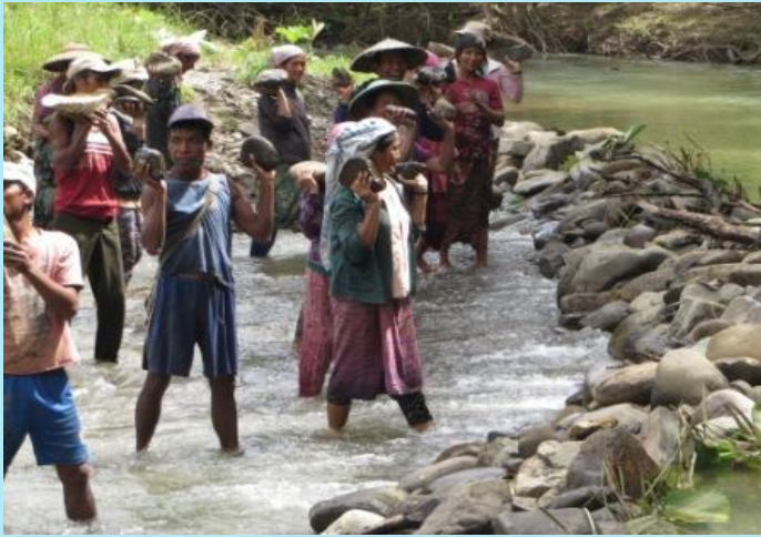
Canal line rehabilitation, Hmawng tlang village, Thantlang Tsp