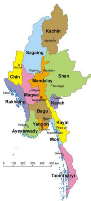
Figure 1: Myanmar Demographics Data

Myanmar has a favorable geographic location in terms of trade: it borders India and Bangladesh to the Northwest, China to the Northeast, and Lao PDR and Thailand to the East. The country has a clear potential to be a regional trading hub. It has extensive fertile land and is richly endowed with natural resources, including oil and natural gas, metals, wood products, and precious stones. However, decades of isolation has left the country severely underdeveloped. Myanmar is one of the poorest countries in Southeast Asia, with a per capita income of approximately $832 in 2011. It was ranked 149 out of 187 countries in the 2011 UNDP Human Development Index. According to the UNDP-supported household surveys, overall poverty was 26 percent in 2009, with significantly higher poverty concentration in rural areas (29 percent rural vs. 15 percent in urban areas) (UNDP 2011).