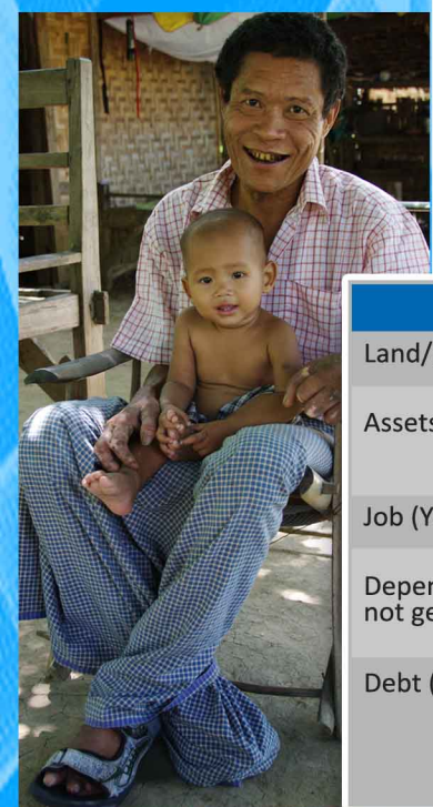
Figure 1: EVS score

This is designed to identify and measure change amongst those who are most at risk of adverse impact of changes to their economic situation. Interview of household determines the score for each category, and then a total score is allocated.