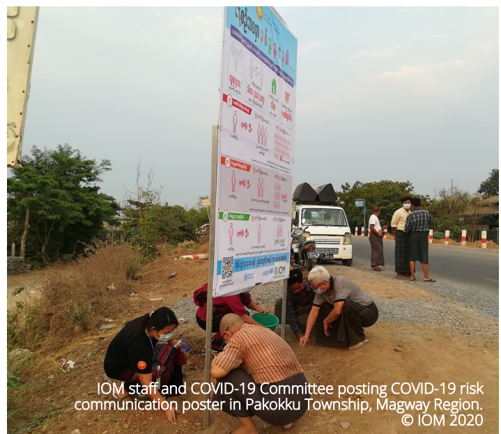
IOM staff and COVID-19 Committee posting COVID-19 risk communication poster in Pakokku Township, Magway Region.

Among Dry Zone returnees not intending to remigrate, 52 per cent said they plan to work in the agriculture sector (men 49%; women 55%), 34 per