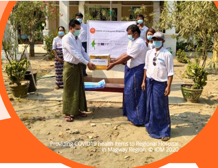
Providing COVID19 health items to Regional Hospital in Magway Region.